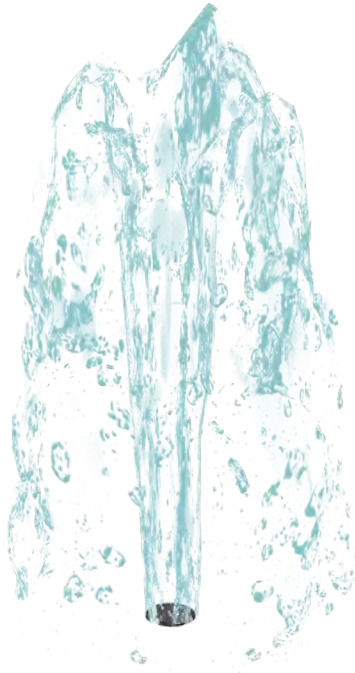
See Specification Sheet for product data.

Cluster ground sprays together to create exciting water experiences for users of all abilities. Ground sprays are a perfect addition to any play zone and create natural gathering areas for exploration and communal play.