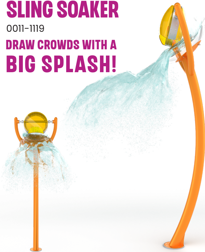
See Specification Sheet for product data.